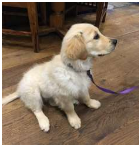
Mabel ~ 13 week old Golden Retriever pup! A gorgeous ball of fluff!