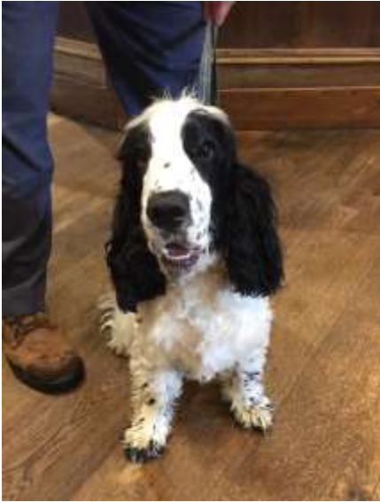
McGregor ~ A 10 month old Spaniel who is also our neighbour! He was out for a rainy local walk and then in to us for treats!