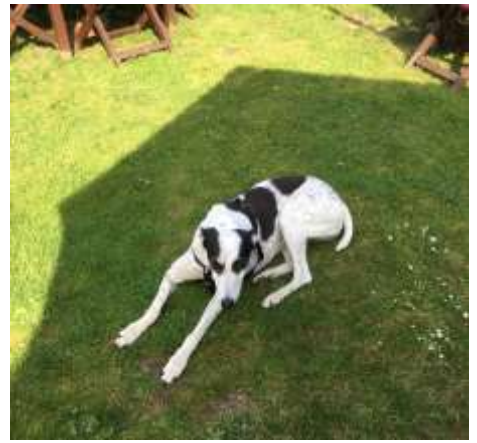
Izzy ~ A lovely long legged Greyhound Cross who found the shade in our sunny garden!