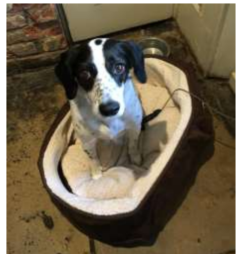
Little Sally ~ This gorgeous 8 year old Springer Spaniel Terrier Cross is a rescue from Shoreham Dogs Trust. She even brought her own bed to avoid the cold stone floor 😊