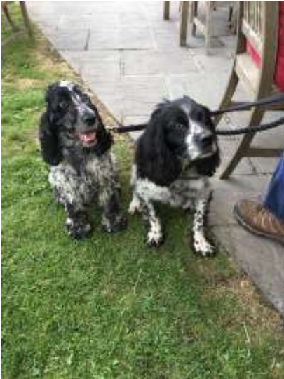
Rika & Loseley ~ Our beautiful 3 year old Cocker and 8 year old Springer Spaniels who were enjoying the garden sun this Summer!