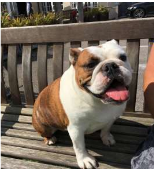
Bow ~ A 3 year old English Bulldog who popped in for a drink before heading to the Annual Bulldog Picnic down the hill!