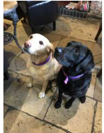
Pebble & Tallulah ~ Both rescued from the Labrador Life Line Trust. Pebble is now 12 and Tallulah is now 11 years old. Both waiting patiently for treats!