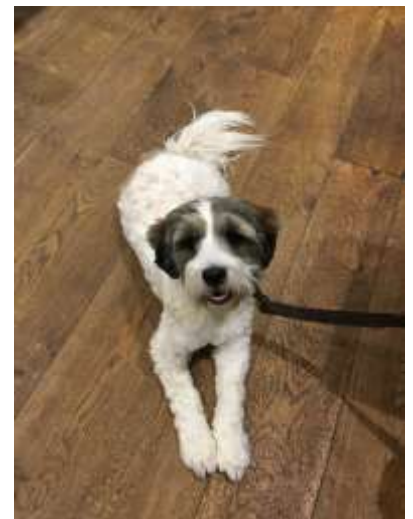
Max ~ 1 year old beautiful Tibetan Terrier who was clearly enjoying relaxing here over lunch!